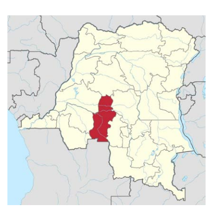
More on our website.