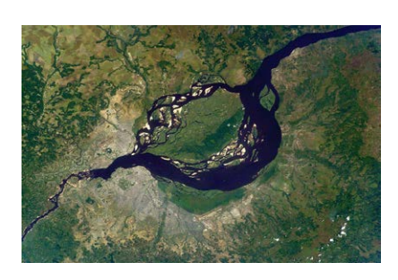
More on our website.

2018, February 19th – On the heels of the 2017 cholera epidemic in the Democratic Republic of the Congo, case numbers have significantly declined in Kinshasa since the outbreak peaked in the capital on January 5th, 2018.